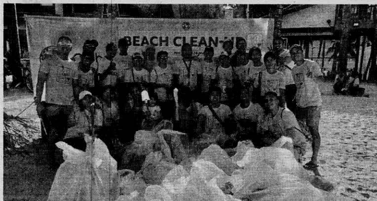
The Globe team gathers several plastic bags full trash during the Boracay beach clean up

In support of the government's call for responsible and sustainable tourism, Globe Telecom joined the week-long celebration of Boracay's rehabilitation aimed at encouraging residents, tourists, and other stakeholders to be more environmentally conscious.