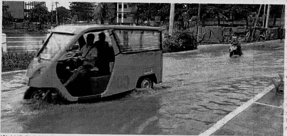
ISLAND FLOODING The main road in the Lake Town area in front of D'Mall complex on Boracay Island is flooded after a downpour on Sunday.

President Duterte ordered the closure of the island to tourists due to the island's environmental problems.