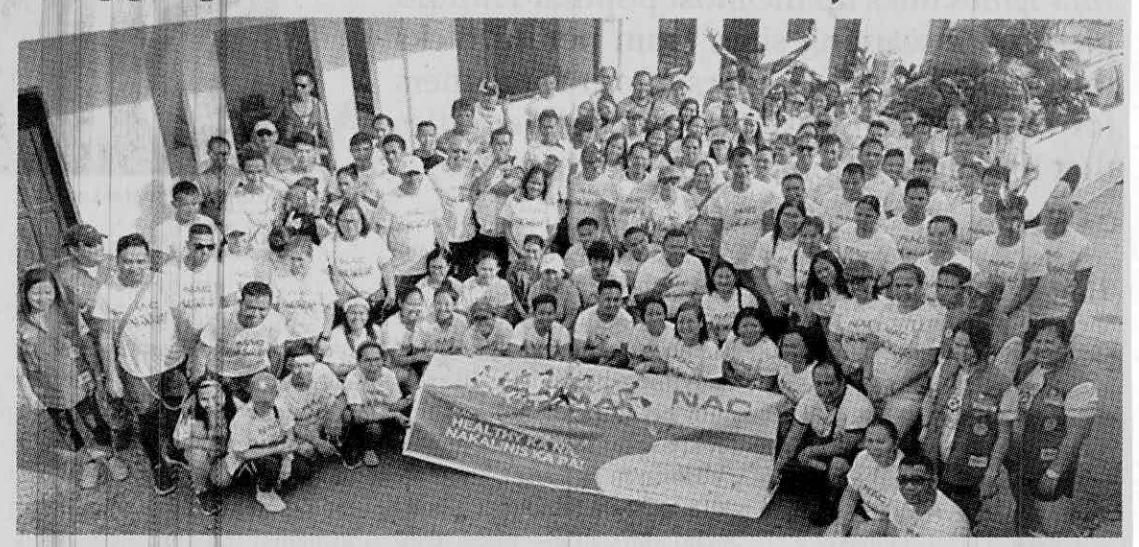
Nickel Asia Corp. group during the World Environment Day 2019.

The NAC-wide plogging was simultaneously conducted by NAC employees and their partners in their respective communities from the company's mining operations