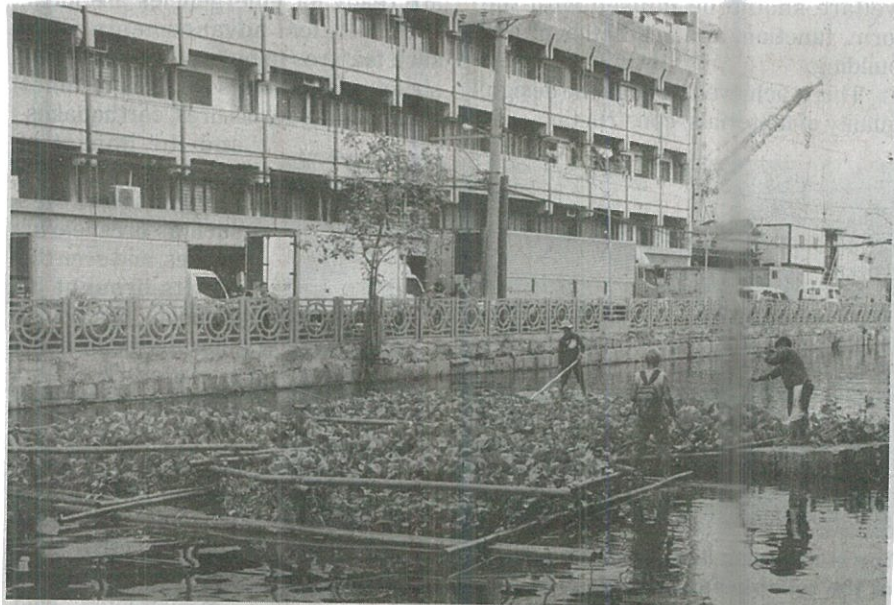
The rise of the number of water hyacinths in Pasig River this rainy season is no cause for an alarm according to PRRC who harnesses the plants' useful purpose.

PRRC is a government agency conferred by the International River Founda'tion with the Inaugural Asia River Prize, the highest award for river restoration efforts in Asia Pacific.